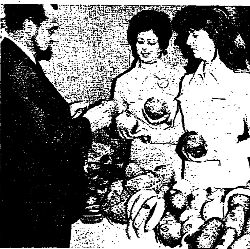
Hostesses at the Israel stand at the Paris International Food Exhibition this week present French Minister of Agriculture Jacques Chirac with some fruit.

have to be depreciated from the present IL4.20 per dollar to IL6 per dollar by then. The Ministry has no reason to doubt that Israel's industry can be competitive at that rate, and is confident that the prospect of customs-free entry to Europe will continue to attract foreign as well as local capital.